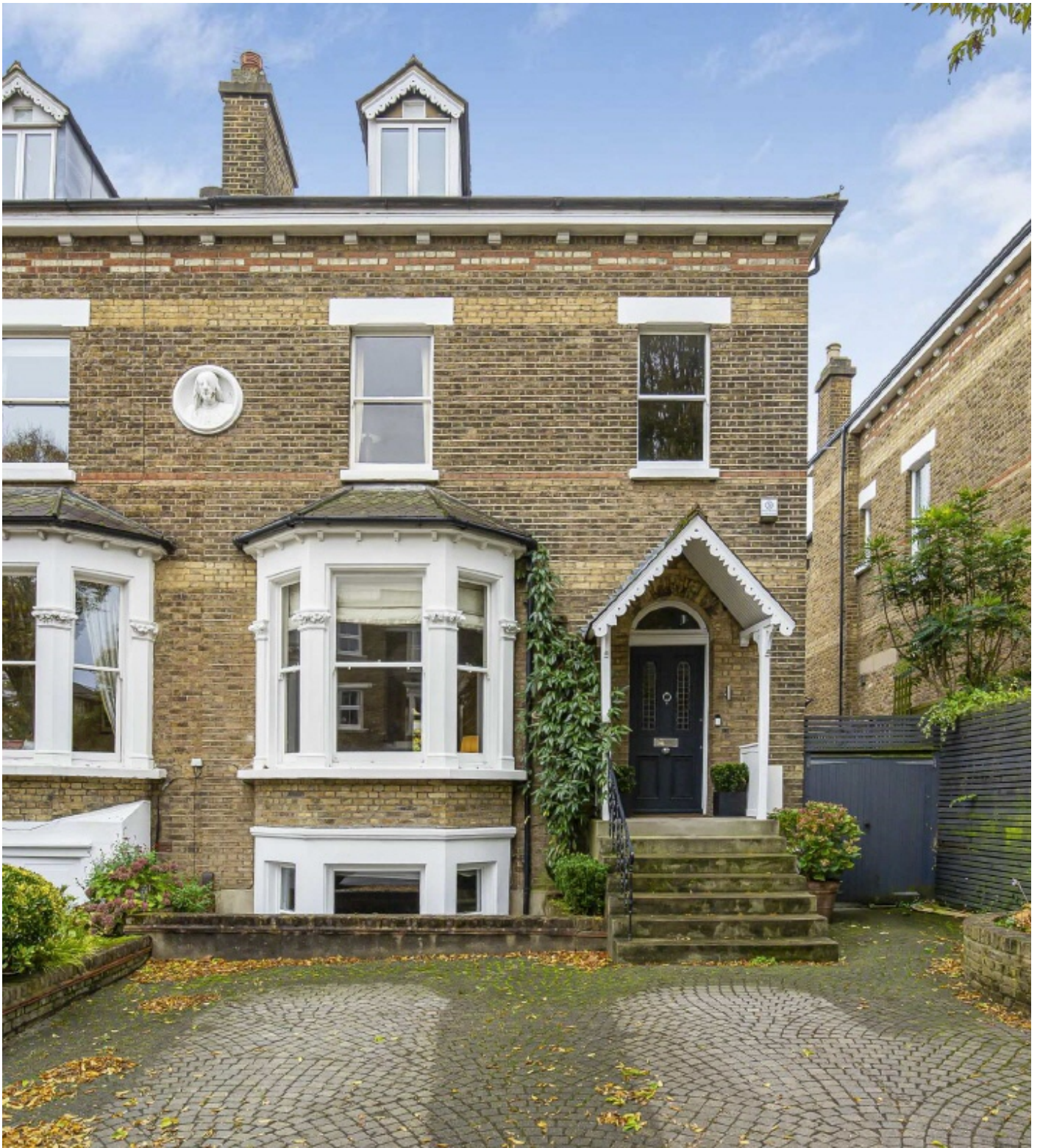
Mount Avenue, W5 £2,500,000