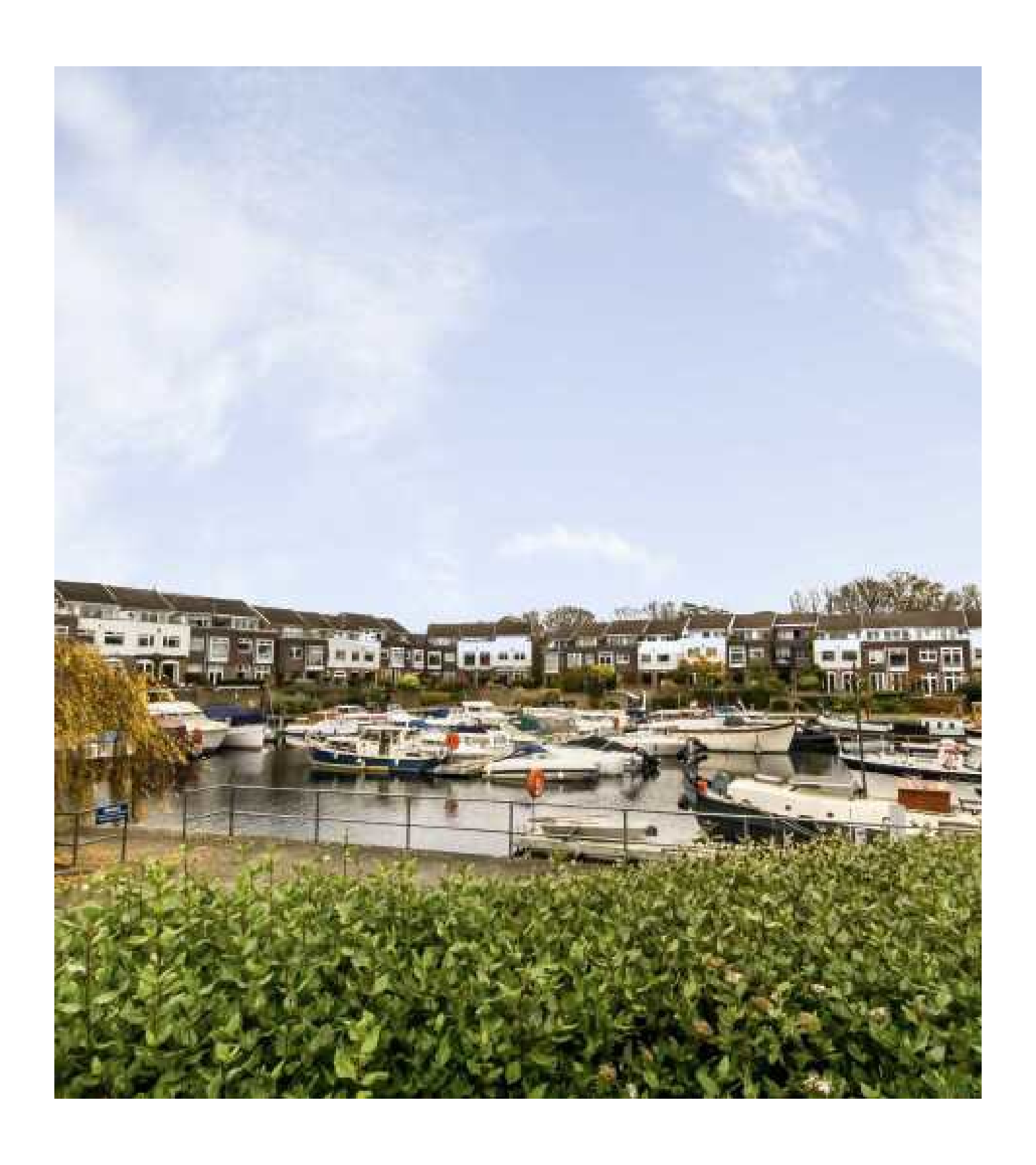
Ibis Lane, W4 £1,326 Per week