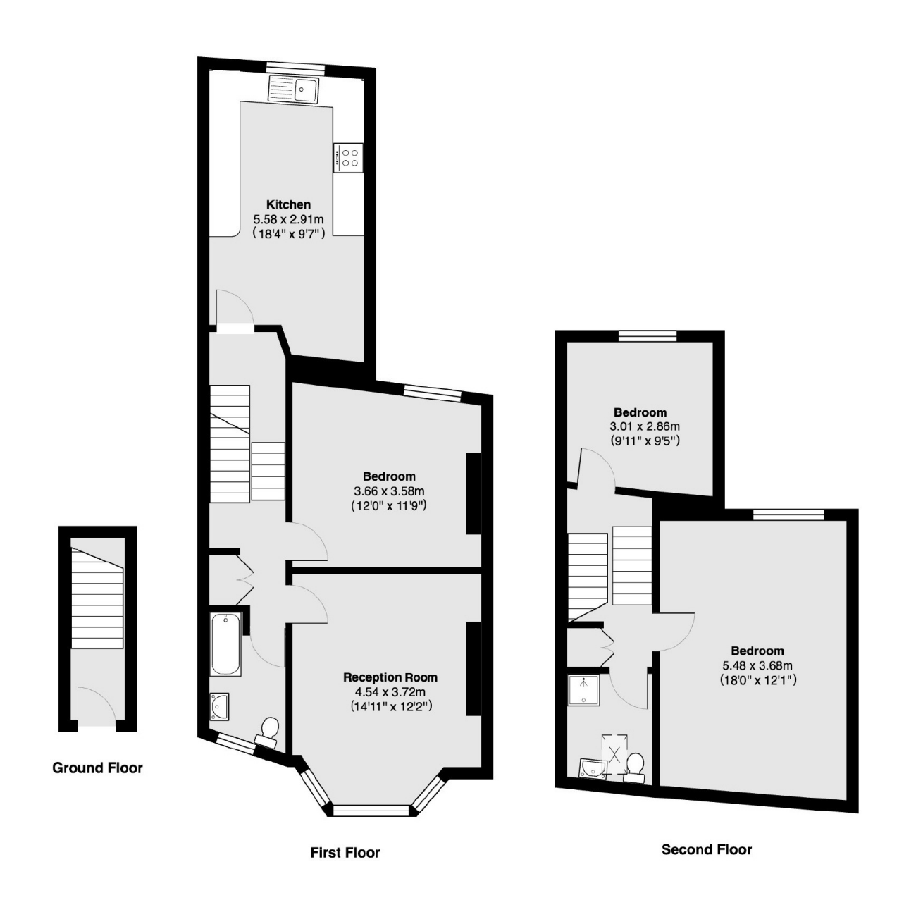
Total area 100.6 sq m (approx) (1082 sq ft approx)