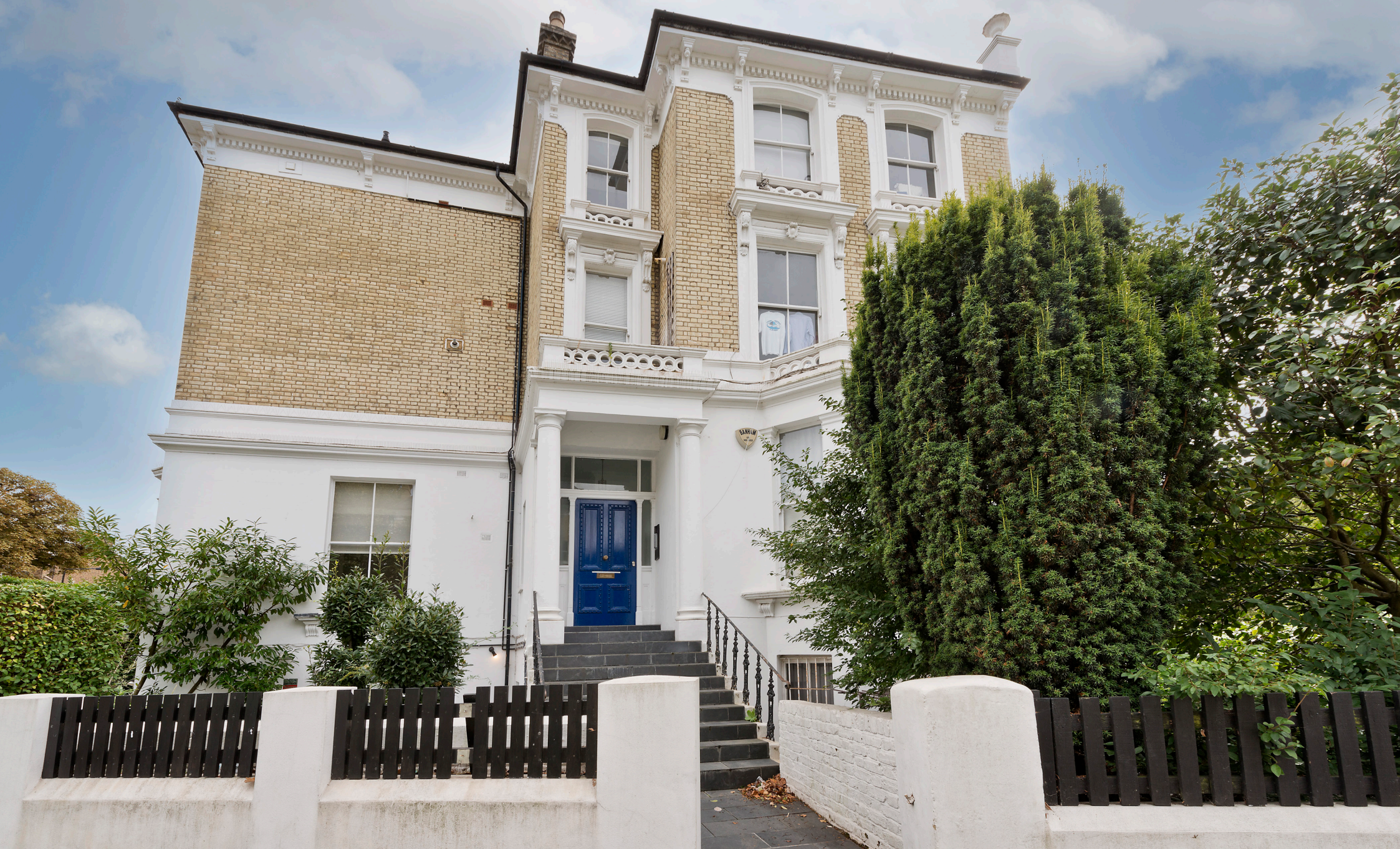
Oxford Gardens, W10