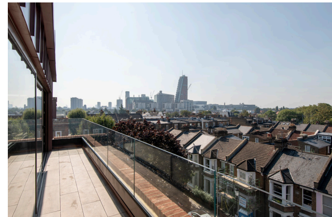
Brewster Gardens, W10