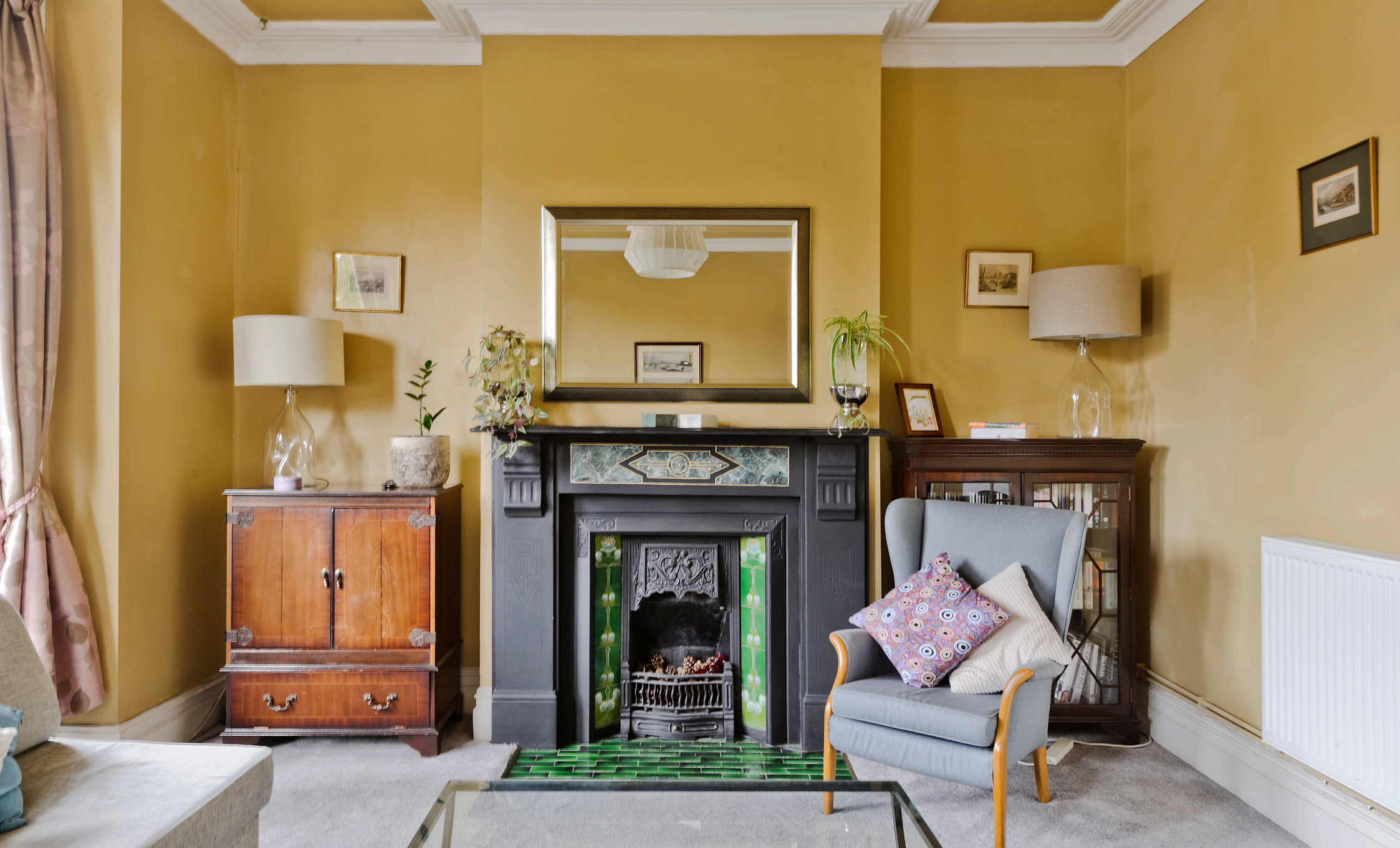
Kelfield Gardens, W10