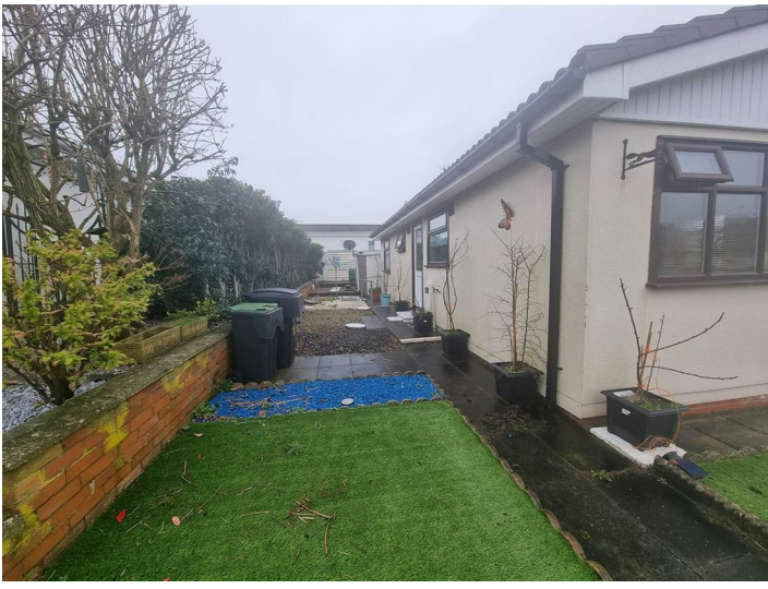
Having paved patio area with front artificial lawns