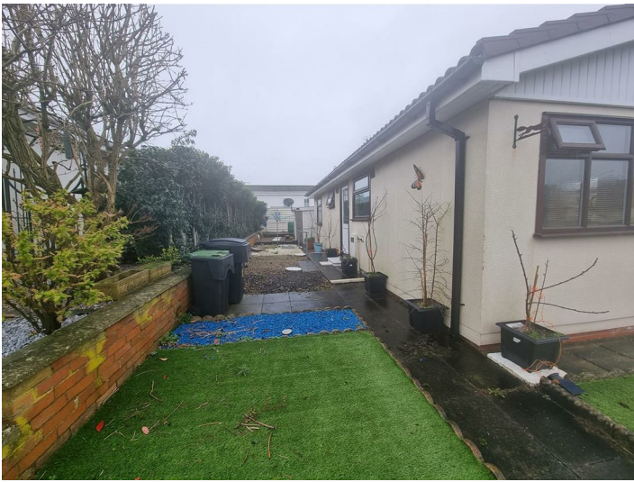
Having paved patio area with front artificial lawns