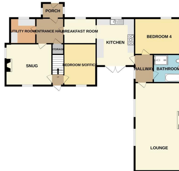
GROUND FLOOR HOUSE 1473 sq.ft. (136.9 sq.m.) approx.