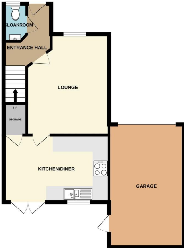
GROUND FLOOR 594 sq.ft. (55.2 sq.m.) approx.