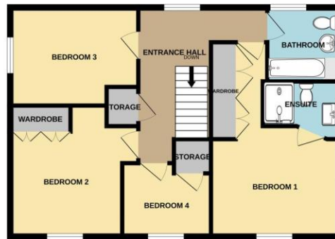
1ST FLOOR 636 sq.ft. (59.1 sq.m.) approx.