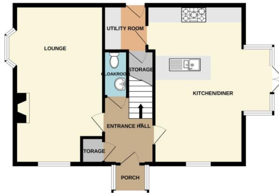
GROUND FLOOR 685 sq.ft. (63.7 sq.m.) approx.