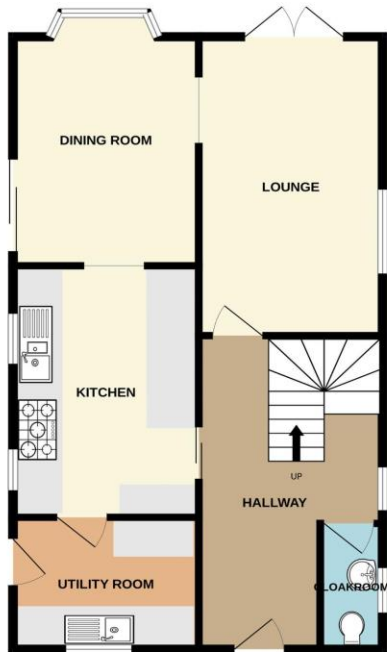
GROUND FLOOR 619 sq.ft. (57.5 sq.m.) approx.