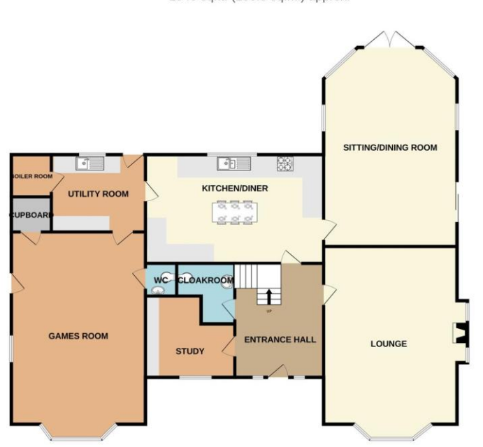
GROUND FLOOR 1940 sq.ft. (180.3 sq.m.) approx.