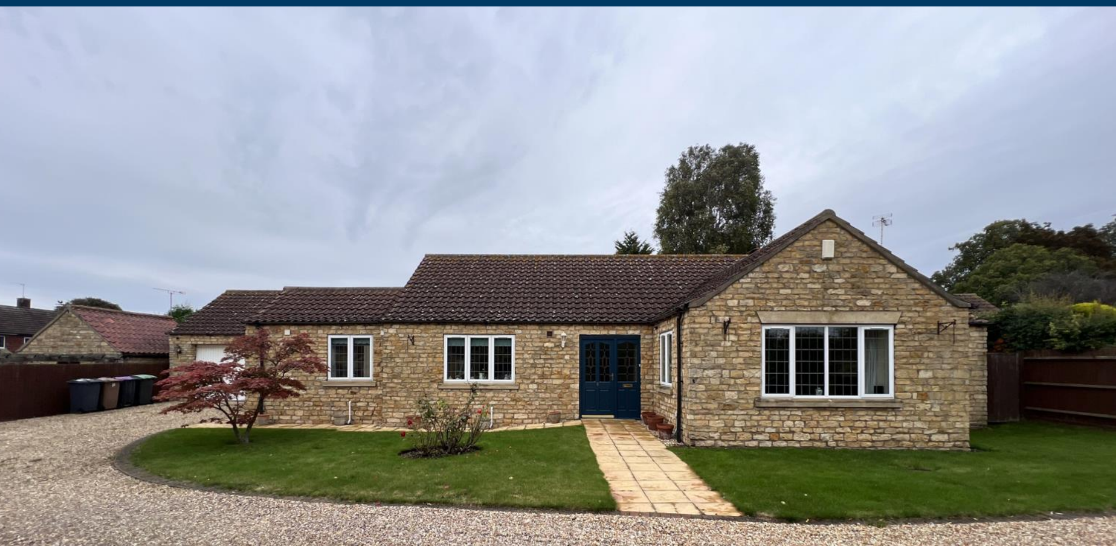
Coupland Close, Waddington