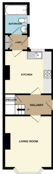
GROUND FLOOR 382 sq.ft. (35.5 sq.m.) approx.