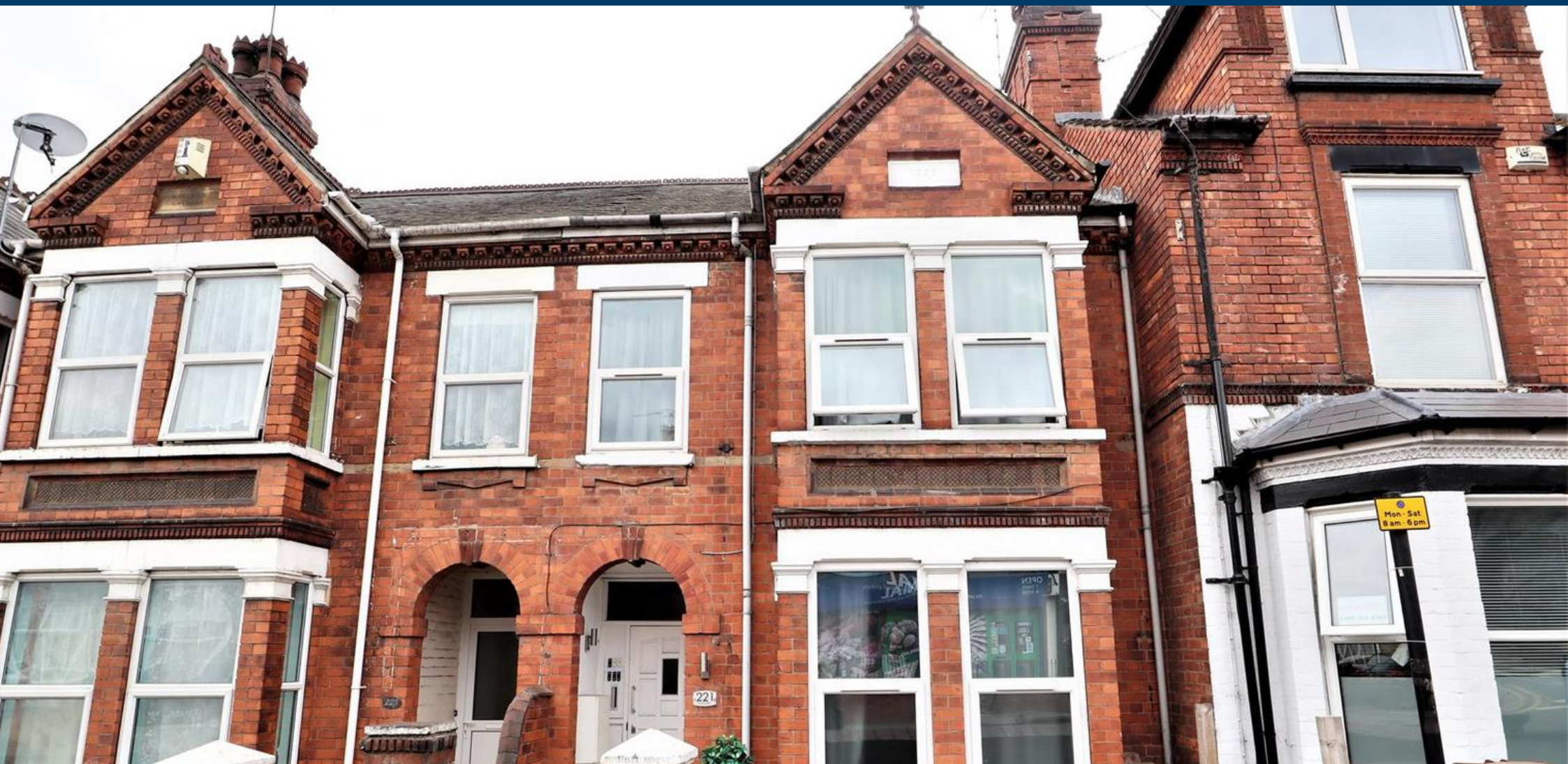
Monks Road, Lincoln