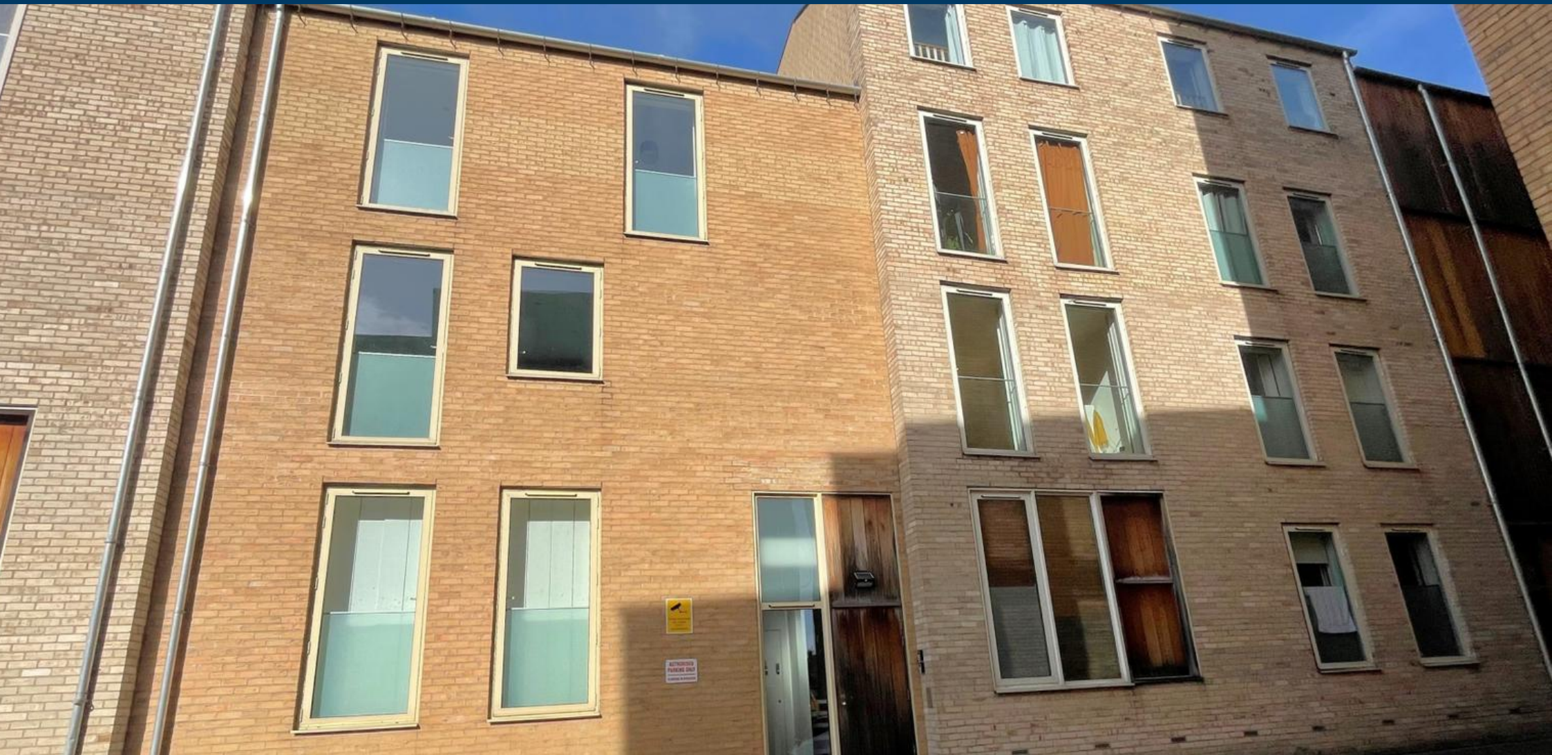
Museum Court, Lincoln