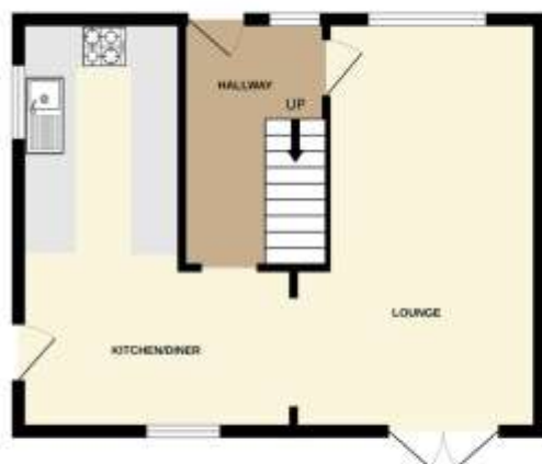
GROUND FLOOR 434 sq.ft. (40.3 sq.m.) approx.