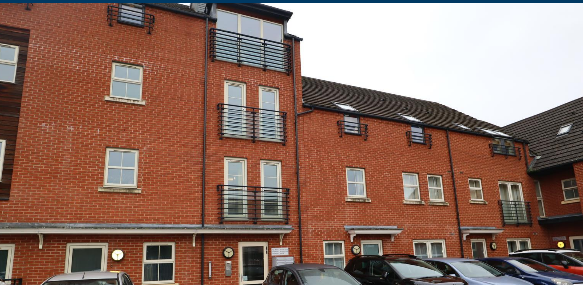
Wesleyan Court, Lincoln