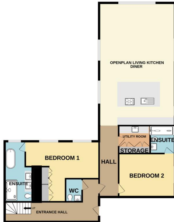
GROUND FLOOR 1486 sq.ft. (138.1 sq.m.) approx.