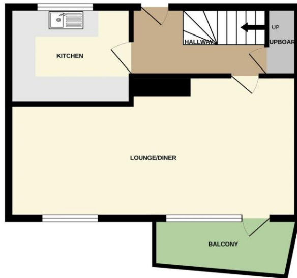
GROUND FLOOR 380 sq.ft. (35.3 sq.m.) approx.