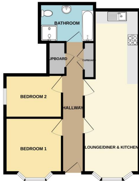
2 BLENHEIM MEWS, LINCOLN LN1 1NH

Whilst every attempt has been made to ensure the accuracy of the floorplan contained here, measurements of doors, windows, rooms and any other items are approximate and no responsibility is taken for any error contained on this statement. This plan is for illustrative purposes only and should be used as such by any prospective purchaser. The accuracy, content and appearance of this plan is not to be relied upon and no guarantee as to their quality or efficiency can be given. Made with Floorplan 1000K