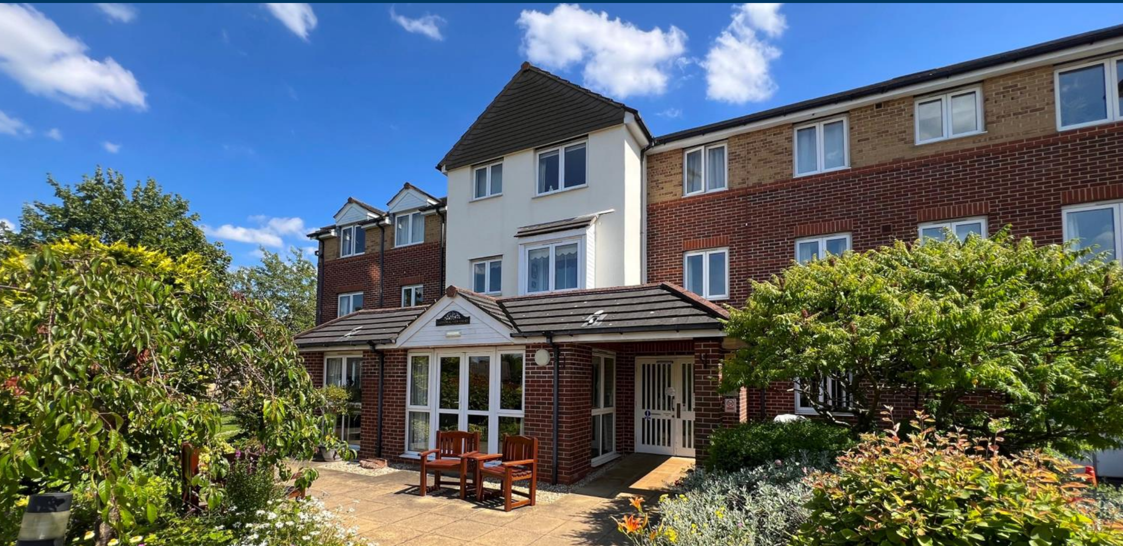
Cathedral View Court, Lincoln