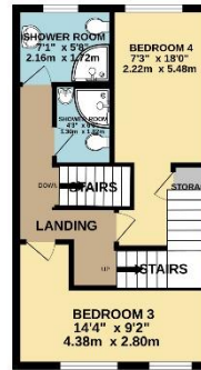
1ST FLOOR 381 sq ft. (35.4 sq.m.) approx.