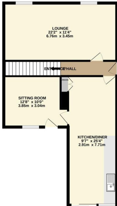
GROUND FLOOR 682 sq.ft. (63.3 sq.m.) approx.