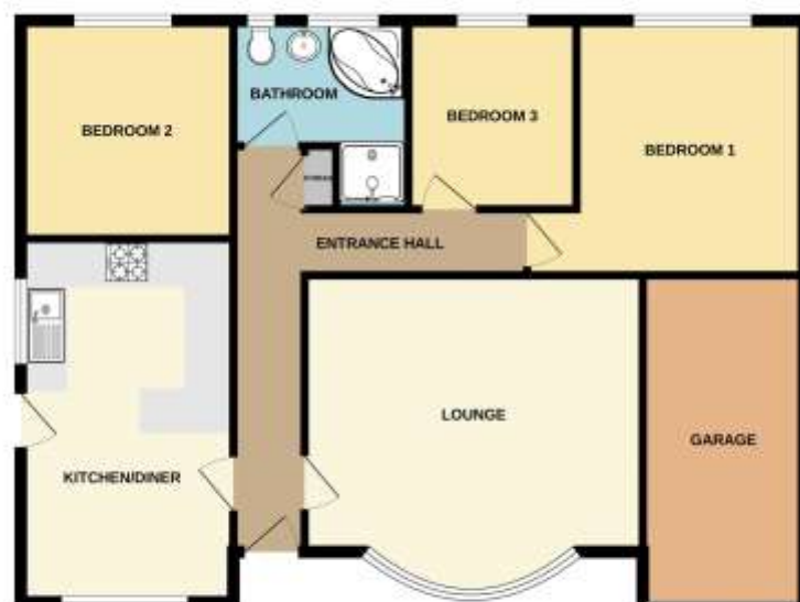
GROUND FLOOR 961 sq.ft. (89.3 sq.m.) approx.

TOTAL FLOOR AREA - 961 sq.ft. (89.3 sq.m.) approx. We warrant that the floor area is correct to the best of our knowledge and belief, but we do not warrant that the floor area is correct to the best of our knowledge and belief, and we do not warrant that the floor area is correct to the best of our knowledge and belief.