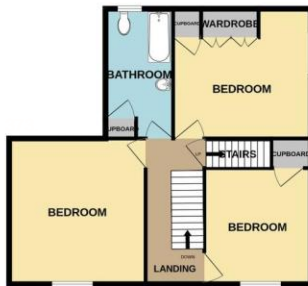
2ND FLOOR 465 sq.ft. (43.2 sq.m.) approx.