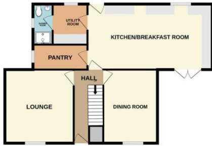
1ST FLOOR 747 sq.ft. (69.4 sq.m.) approx.