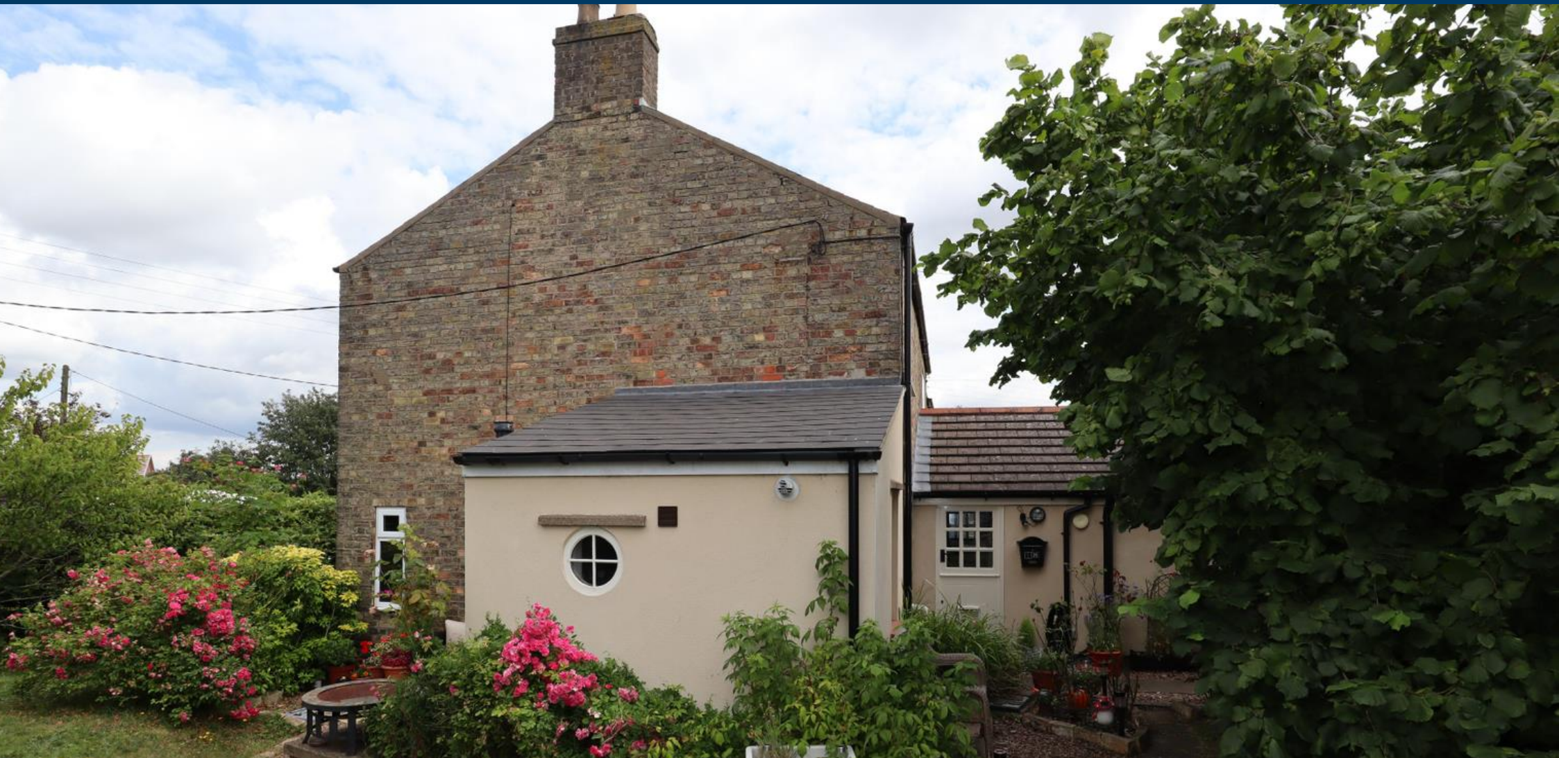
Mill Hill, Nettleham