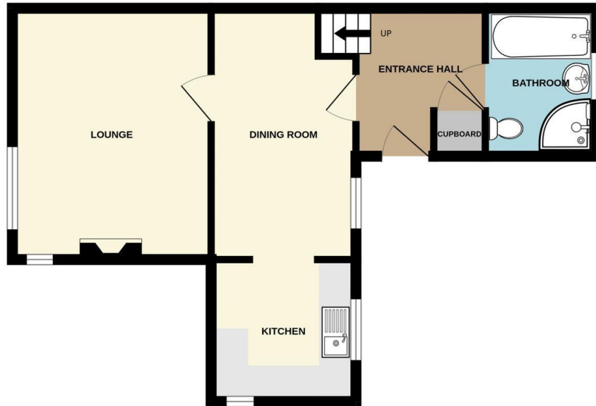
GROUND FLOOR 411 sq.ft. (38.2 sq.m.) approx.