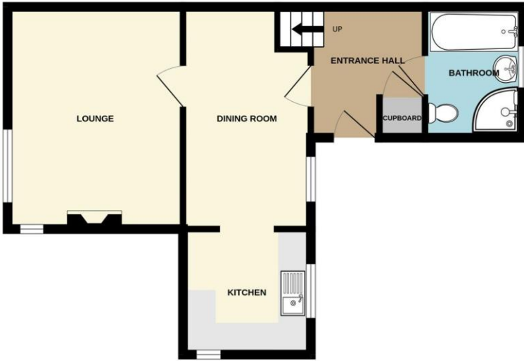
GROUND FLOOR 411 sq.ft. (38.2 sq.m.) approx.