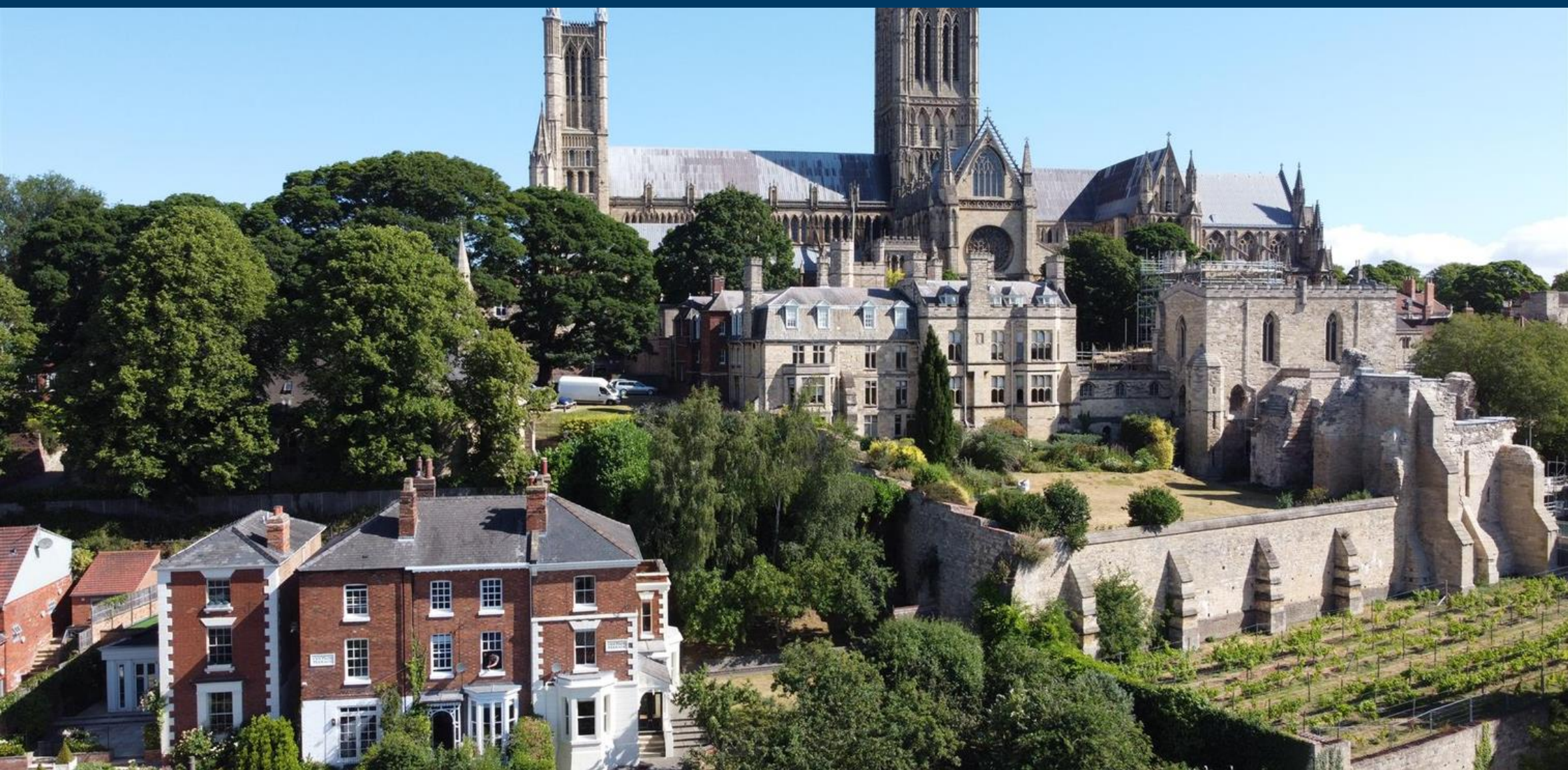
Ventnor Terrace, Lincoln