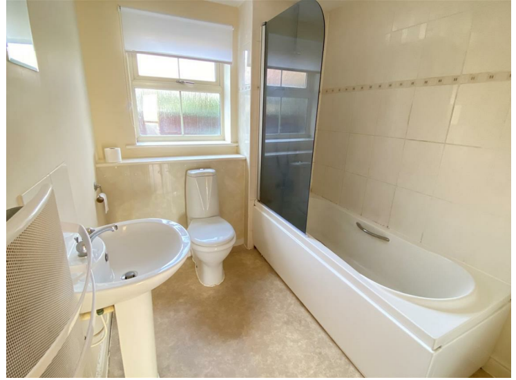
Bathroom 7'10 x 6'8 (2.39m x 2.03m)

With window to the rear elevation, wall mounted panel heater with towel rail, panelled bath with shower, low level wc and washbasin.