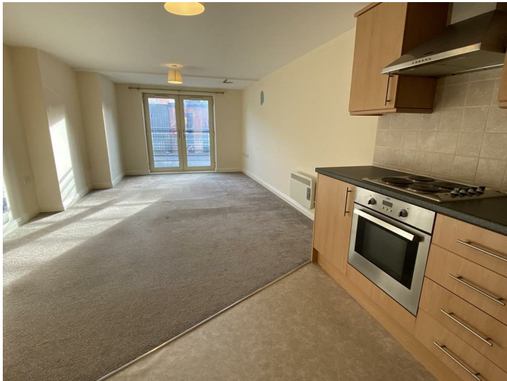
With living and kitchen areas.