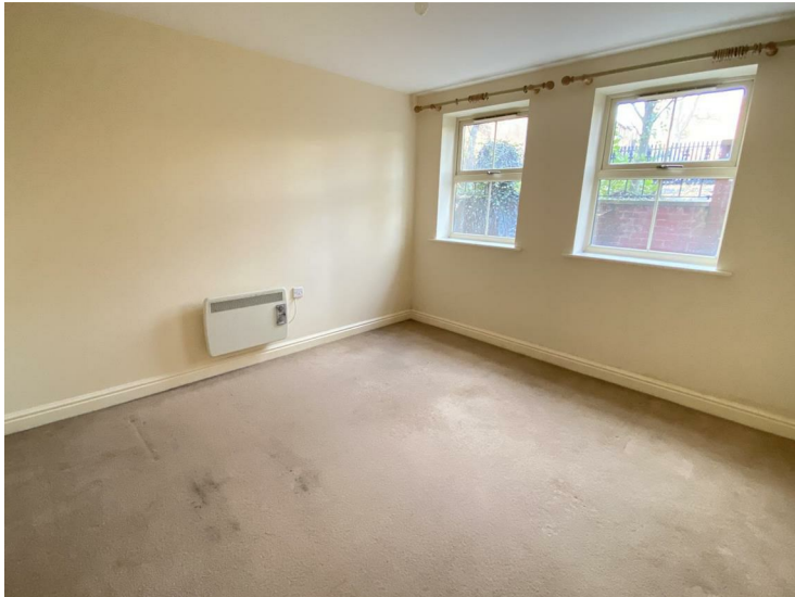
Bedroom 2 11'10 x 10'10 (3.61m x 3.30m)

With window to the rear elevation and wall mounted electric panel heater.