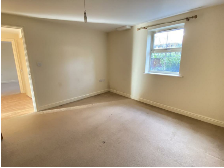
Bedroom 1 12'2 x 11'10 (3.71m x 3.61m)

With window to the rear elevation and wall mounted electric panel heater.