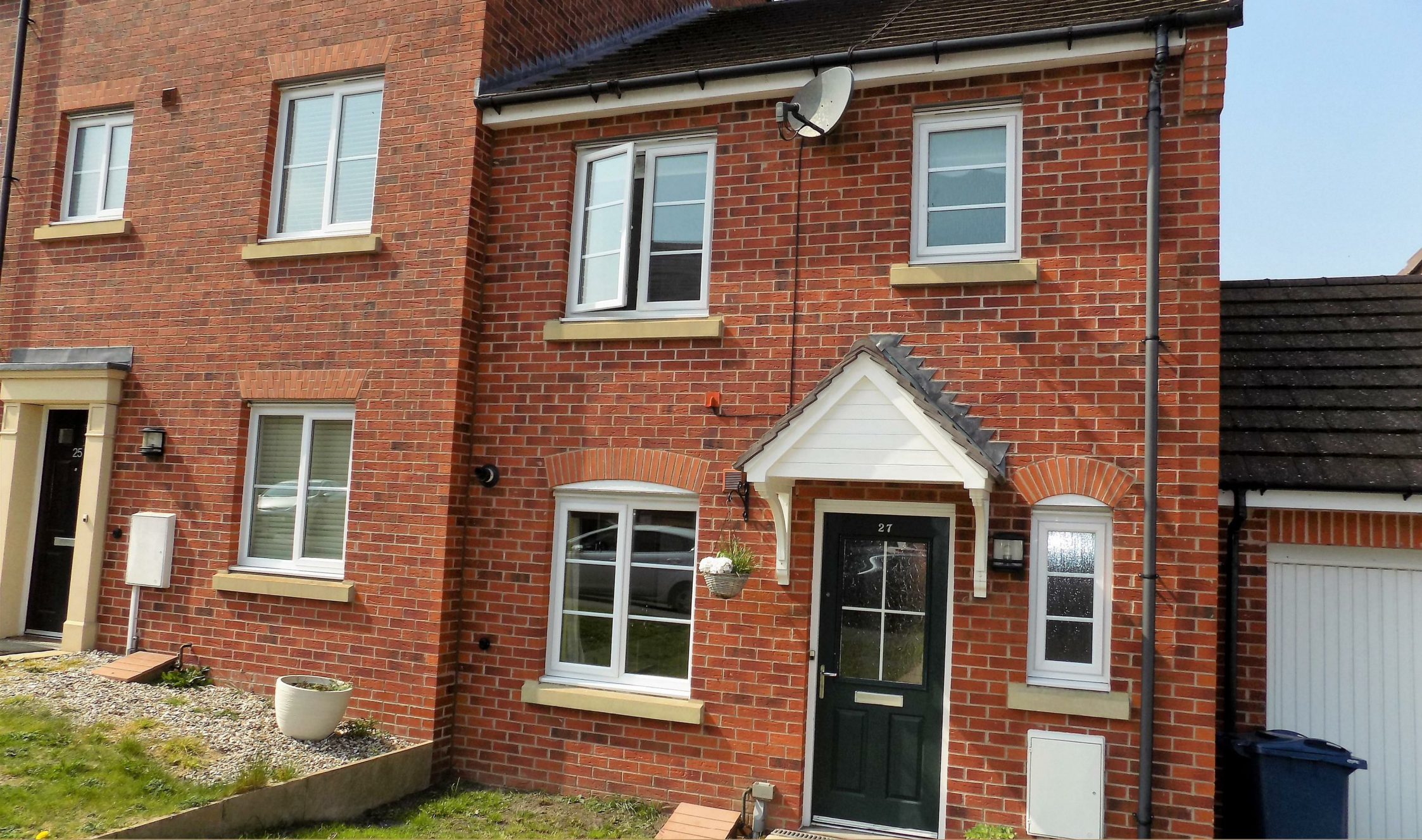
Calder Gardens, Bingham Nottingham, Nottinghamshire, NG13 8YY