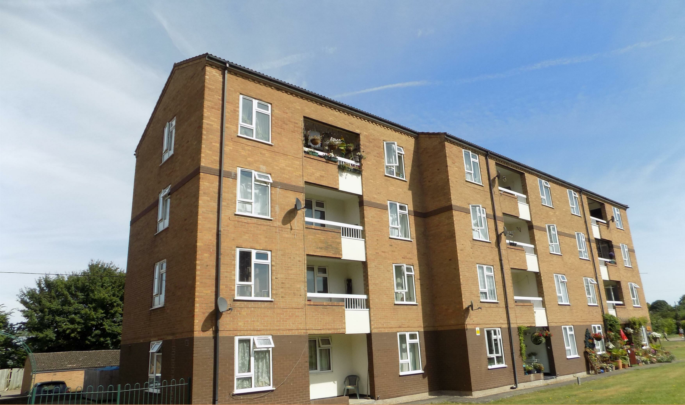
Carnarvon Close, Bingham Nottingham, Nottinghamshire, NG13 8RR