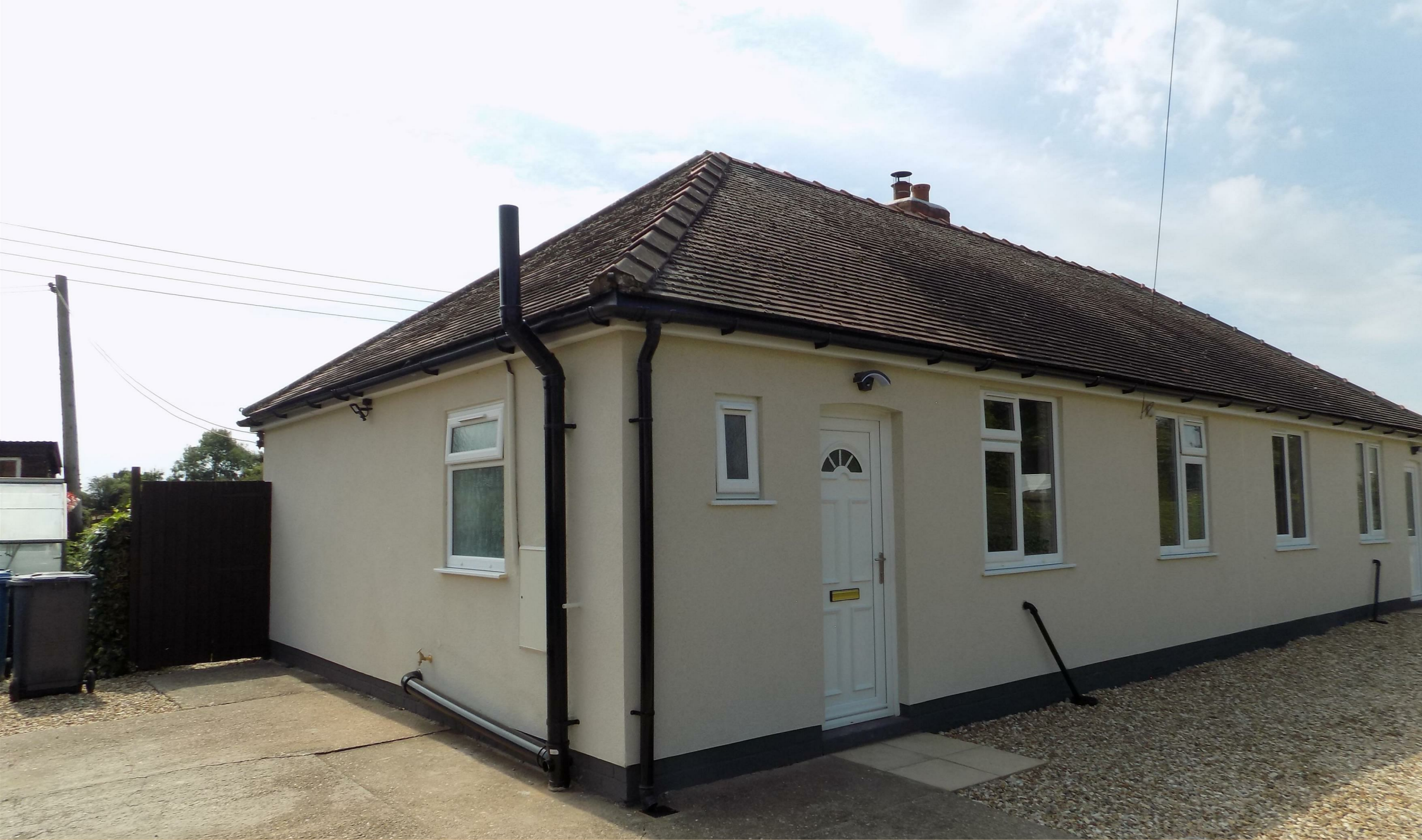
Field Bungalow, Aslockton Bingham, NG13 9AR