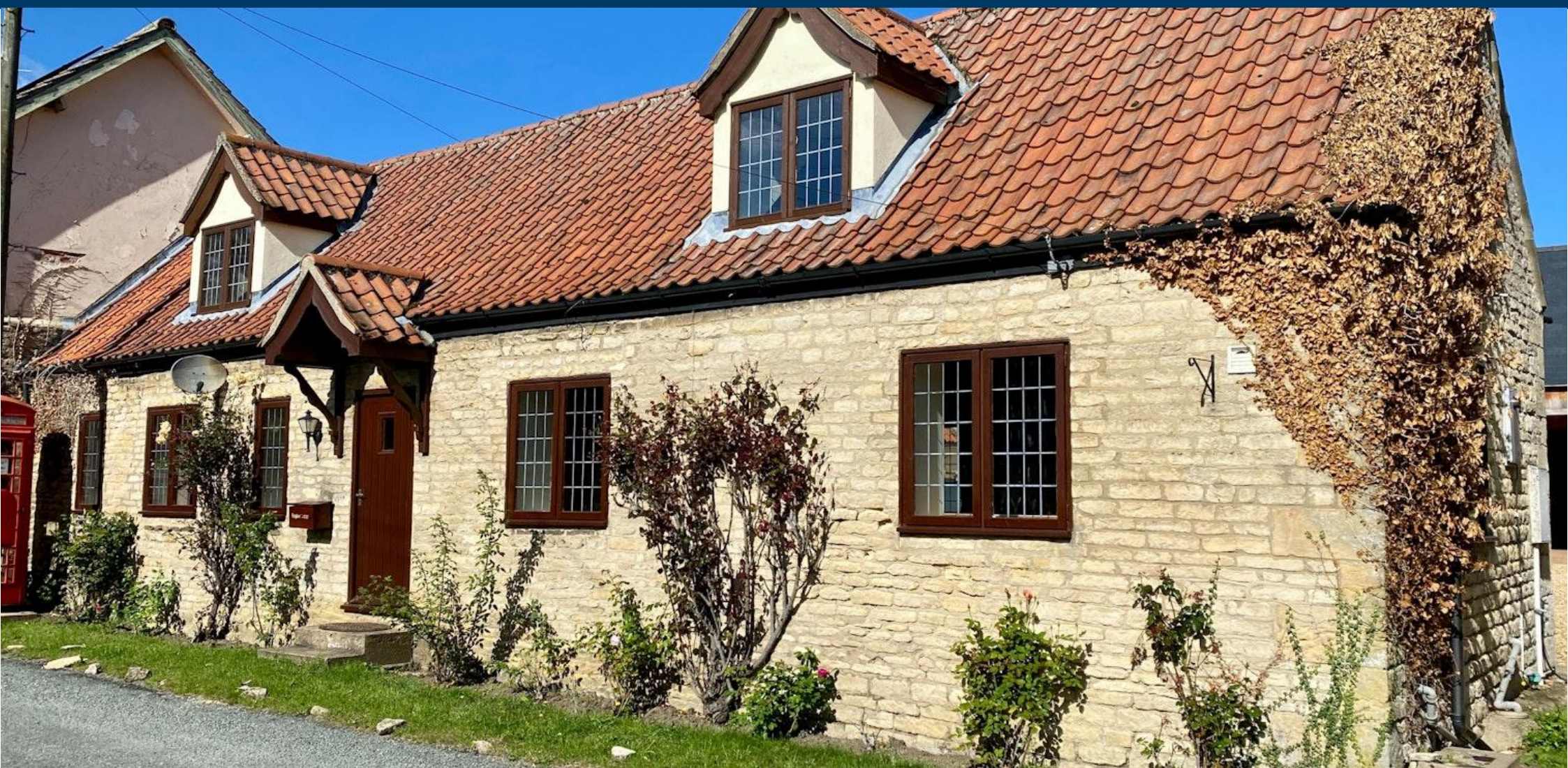
Foxglove Cottage, Village Street, Oasby, Grantham. NG32 3NB