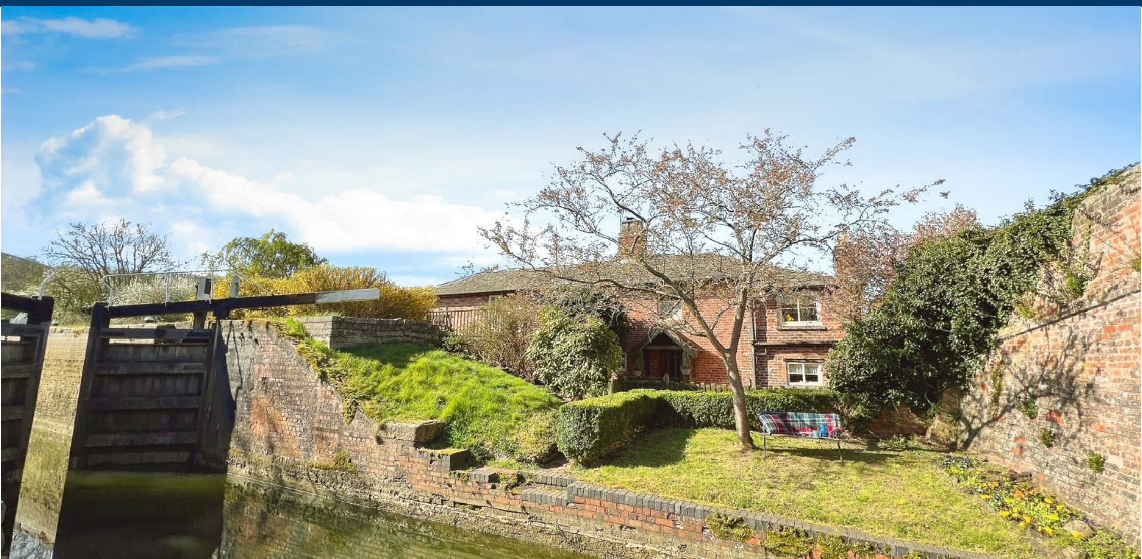
The Lock House, Sedgebrook Road, Woolsthorpe By Belvoir, NG32 1NY