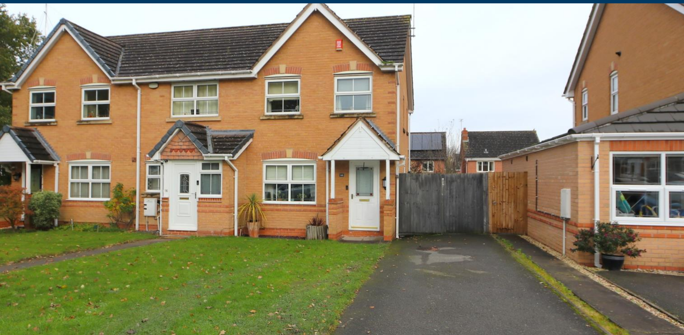
Keepers Close, Moira