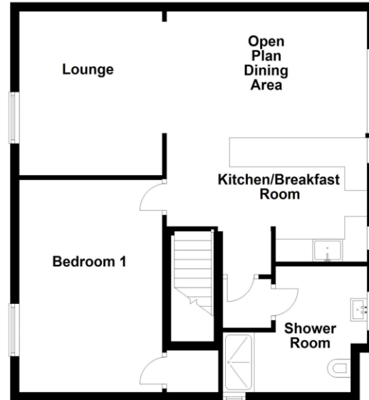
First Floor Apartment