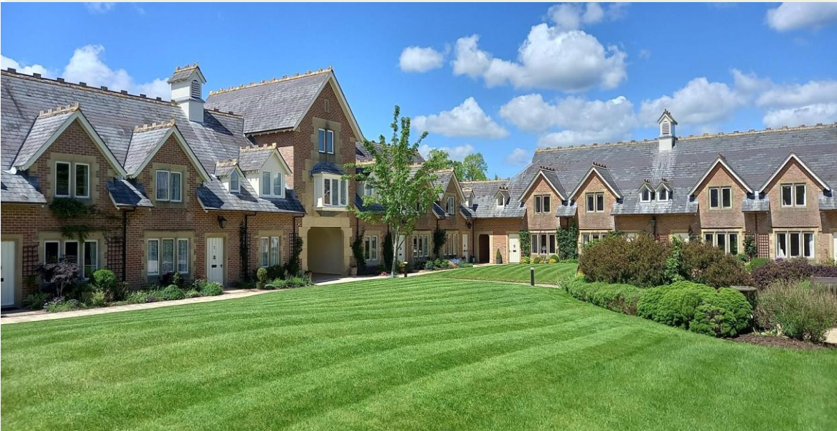
The Courtyard at Walpole Court