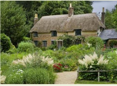
Thomas Hardy's Cottage (NT)

Cognatum Property Limited, Pipe House, Lupton Road, Wallingford, Oxfordshire OX10 9BS T: 01491 821170 E: property@cognatum.co.uk www.cognatum.co.uk