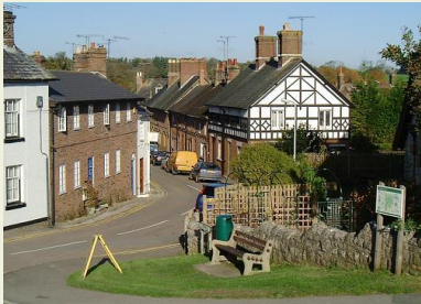
Puddletown High Street