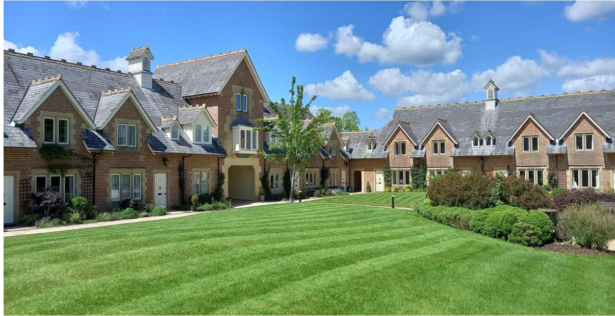
The Courtyard at Walpole Court