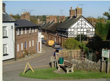
Puddletown High Street