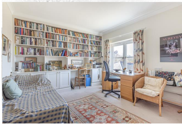
Bedroom 2/ Study