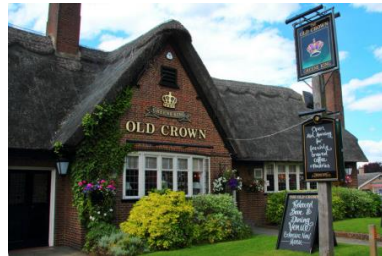
The Old Crown