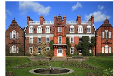
Girton College, Cambridge