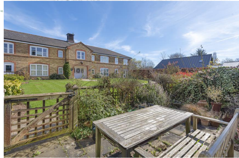
Patio Garden overlooking courtyard gardens

Approximate Gross Internals: 125.4 m 2 / 1350 ft 2