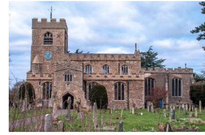
St Andrew's Church

Cognatum Property Limited, Pipe House, Lupton Road, Wallingford, Oxfordshire OX10 9BS