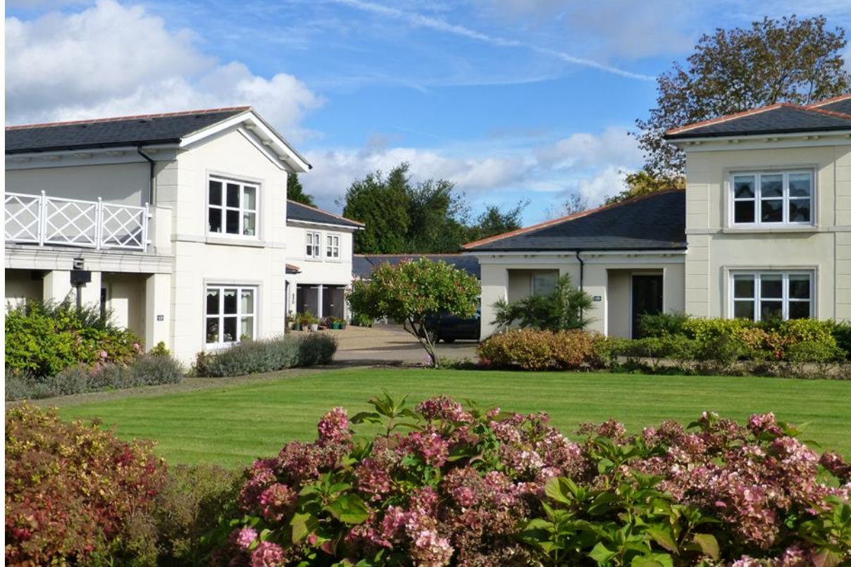
View of the gardens/grounds at Muskerry Court

Cognatum Estates Limited provides the services and amenities shown below together with the maintenance, repair and insurance of the buildings, personal alarms, window cleaning and refuse collection. The cost of providing these services is shared equally between all properties.