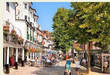
Royal Tunbridge Wells