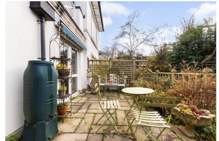
Rear with garden