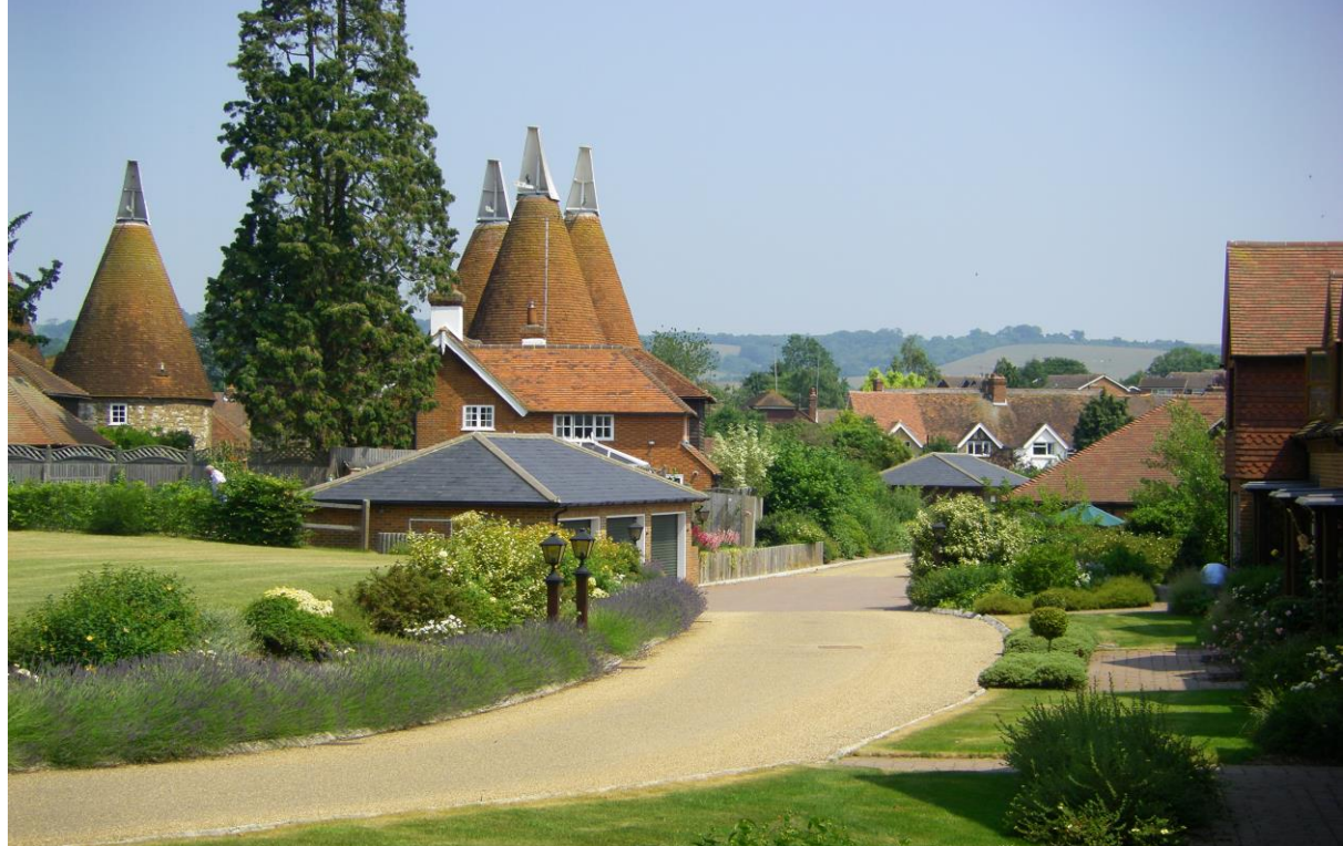
View of the Oast Houses from Eylesden Court