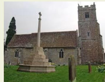
Holy Cross Bearsted