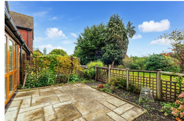
Rear with garden

This floor plan has been drawn in accordance with RICS Property Measurement 2nd edition. All measurements, including the floor area, are approximate and for illustrative purposes only. @fourwalls-group.com #67273