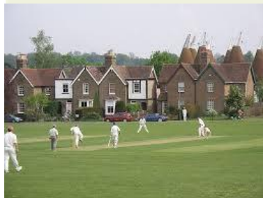
Bearsted Cricket Pitch