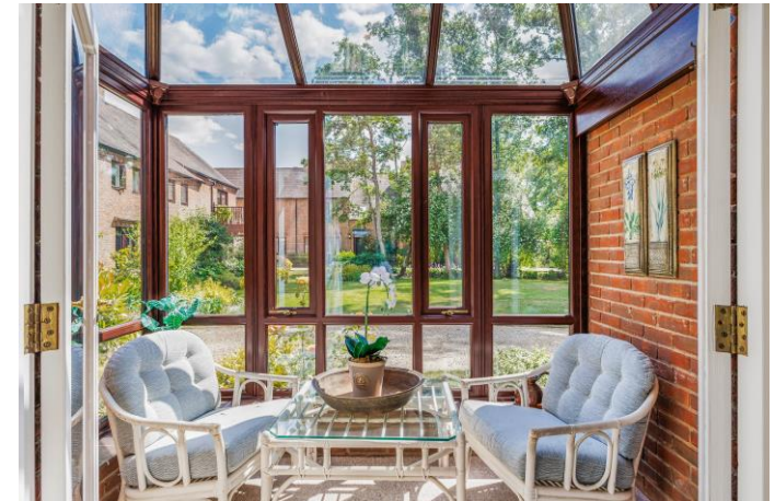
Conservatory / Sun Room

(Not Shown In Actual Location / Orientation)