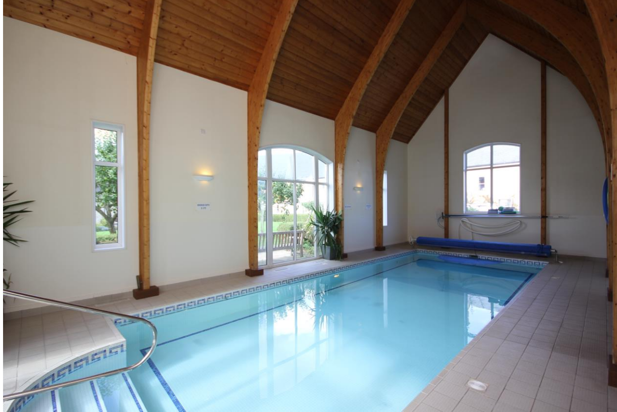
The Swimming Pavilion