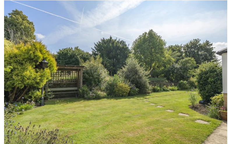
Rear with garden

Approximate Gross Internals: 123.2m 2 / 1326ft 2 Service Charge: £7420 pa Energy Performance Rating: D Council Tax Band: F