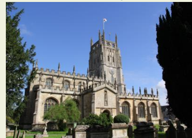
St Marys Church