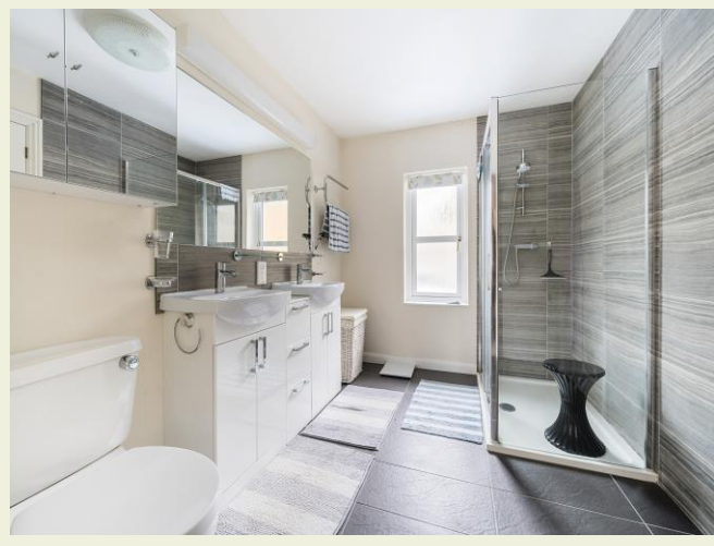
Sun Room Bedroom 1 of 2 Bathroom