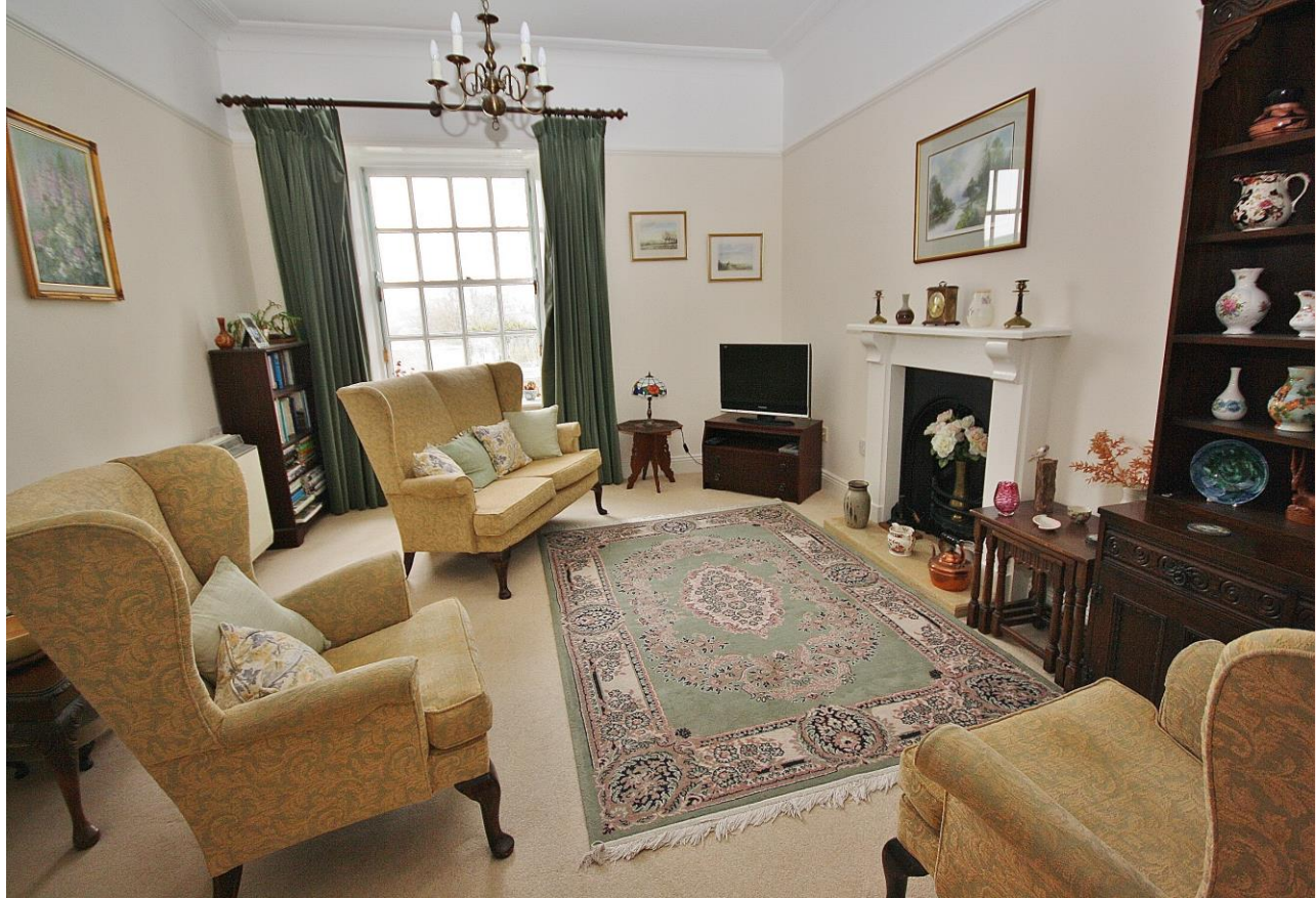
Sitting / Dining room

For viewings please contact the Estate Managers on 01460 57882