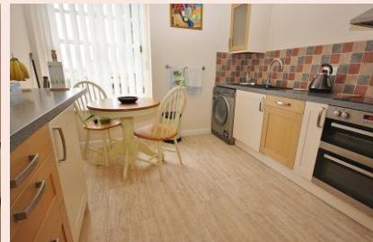
Kitchen / Breakfast Room