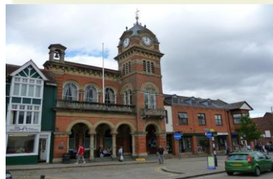
Hungerford Town Hall