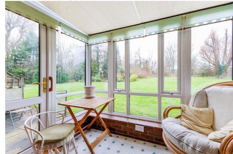
Conservatory with views over the meadow

Approximate Gross Internals: 102.4 m 2 / 1102 ft 2 Service Charge: £5,144 pa Energy Performance Rating: TBC Council Tax Band: F