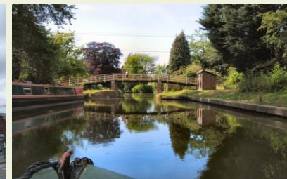
Kennet & Avon Canal