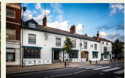
The Three Swans Hotel

Cognatum Property Limited, Pipe House, Lupton Road, Wallingford, Oxfordshire OX10 9BS