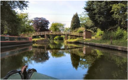
Kennet & Avon Canal