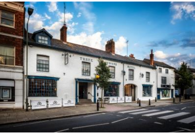
The Three Swans Hotel

Cognatum Property Limited, Pipe House, Lupton Road, Wallingford, Oxfordshire OX10 9BS T: 01491 821170 E: property@cognatum.co.uk www.cognatum.co.uk