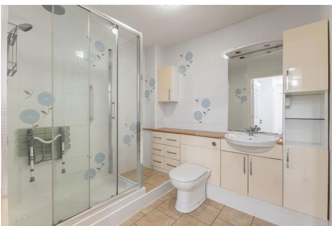
Walk in Shower Room