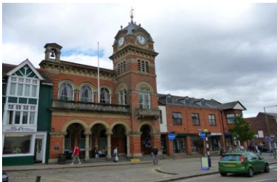
Hungerford Town Hall