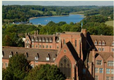
Ardingly College & Reservoir