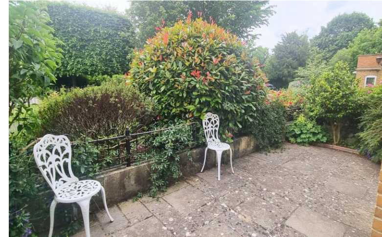
Rear with garden

Approximate Gross Internals: 108.6 m 2 / 1170ft 2 Service Charge: £9544 pa Energy Performance Rating: C Council Tax Band: F