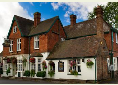
The Ardingly Inn

Cognatum Property Limited, Pipe House, Lupton Road, Wallingford, Oxfordshire OX10 9BS